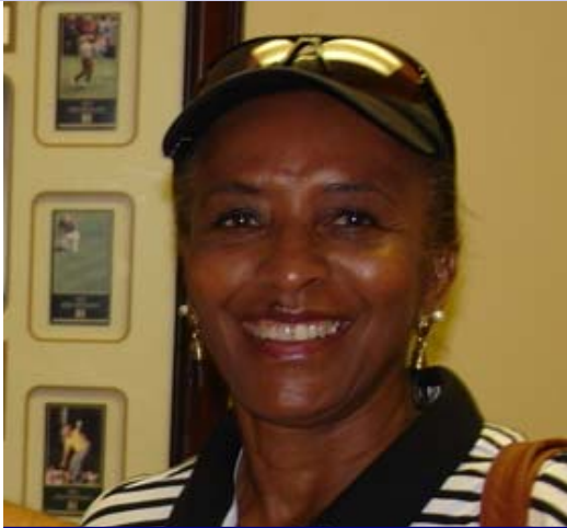
2009 Bay Pointe Ladies Club Champion Congratulations,